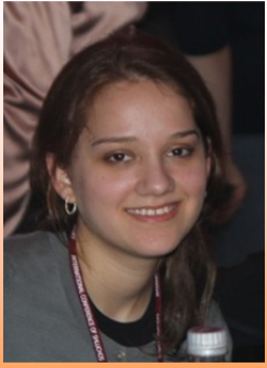
Rochel Freedman Kindergarten

Our teachers are hand-picked for their warmth, devotion and depth of knowledge. In the time they have been teaching your children they have shown extraordinary dedication. We thank them for their love, hard work and care that they have shown to every one of our students.